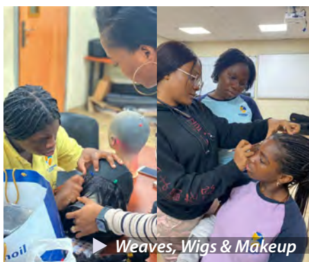
► Weaves, Wigs & Makeup