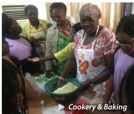
► Cookery & Baking