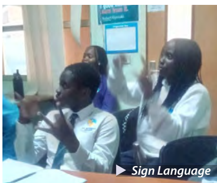
► Sign Language