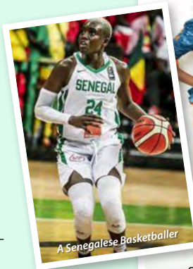
A Senegalese Basketballer

People in Senegal eat millet or rice. Senegal's culinary specialties consist essentially of fish (grilled), braised, smoked or salted) or mutton, or even beef on special occasions. Ginger, peanut, chili and many vegetables such as cabbages, carrots, eggplants, gombos, cowpeas, and cassava are the flavours. Soupou Kandja is a favorite dish among Senegalese. It consists of meat served with okra sauce and palm oil. It is accompanied with rice, dried fish and dried mollusk, seafood, smoked fish. Domoda is a dish originating in eastern Senegal. There are three varieties of domoda with meat, fish or dumplings. Hmm... Senegalese must be enjoying so much mouth-watering dishes. Wouldn't you like to have a taste too?