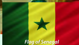
Flag of Senegal

Some Senegalese dancers entertaining an audience.